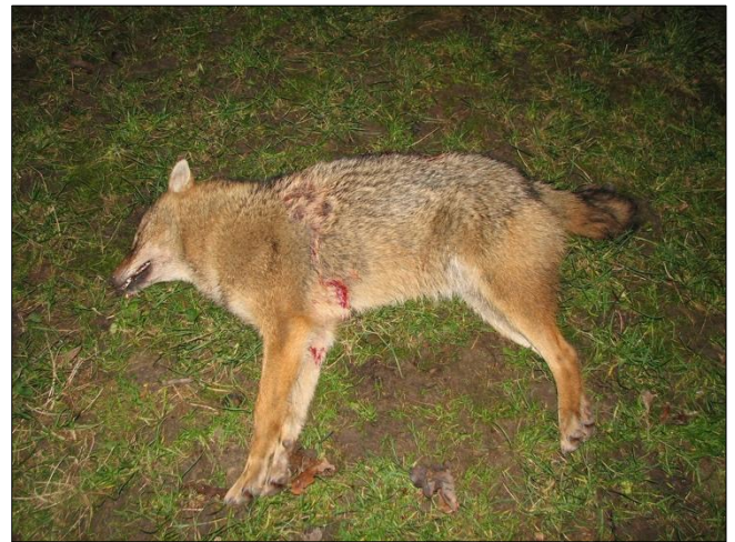
Figure 3. Golden jackal hunted in 2009 in Veľký Krtíš (VK) district.