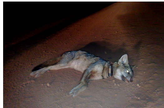
Figure 2. Monitored hoary fox road-killed at a dirt road, Limoeiro region, Cumari, Goiás state, Brazil.