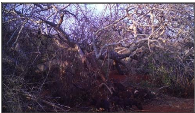
Figure 4. Camera trap image of eight wild dog pups at their den within the Rukinga Wildlife Sanctuary, south-east Kenya – sighting S15 on Table 1.

The recent efforts to erect electric fences at various points around Tsavo East and West National Parks to keep elephants out of farmlands are unlikely to stop wide-ranging species like wild dogs from coming into contact with humans and livestock. Despite this, we believe there are three reasons for an optimistic outlook for the wild dogs in the Tsavo ecosystem: The TCA protected area network, REDD+ conservation projects, and captive breeding programme. First, the protected area network covering a total of about 26,000km 2 of near-ideal wild dog habitat can sustain several packs, even considering competition from other carnivores. Prey availability should not be a major limiting factor given the abundance of medium-sized antelopes which are the preferred prey (e.g. kudu, impala, warthog, Grant's gazelle, kongoni) and several small-sized ones like duikers and dik diks. The recent campaign to rid the ranches of illegal livestock and herders and convert some of these ranches into conservancies will improve the conservation status of both protected and unprotected areas across this ecosystem, besides reducing persecution from wild dogs taking livestock. Secondly, the problem of poor connectivity across