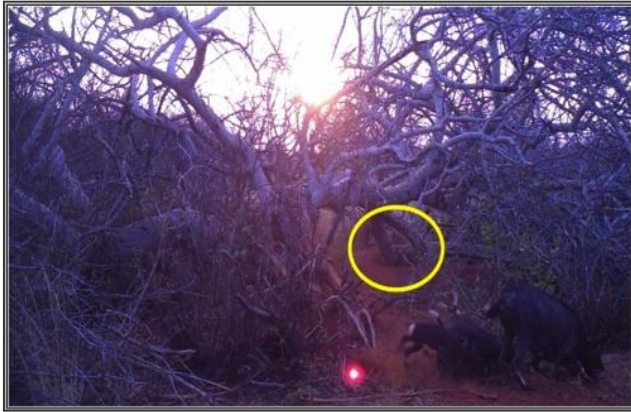
Figure 3. Camera trap image of an adult wild dog regurgitating to pups at dawn within the Rukinga Wildlife Sanctuary, south-east Kenya – sighting S15 on Table 1. The actual den is highlighted in yellow. (NB: the date ribbon was left out because this camera mal-functioned soon after it was placed by the den, and reset its dates back to factory settings.)

ing methods gives them the unfortunate vermin badge, rendering them targets for elimination by farmers, hunters and pastoralists. Their management hinges on six key limiting factors: prey availability, vast ranges, persecution, cooperative hunting and breeding, interference competition and diseases. With the livestock within ranches and human habitations along the Kasigau Corridor, it is practically impossible to completely eradicate human-carnivore contact and the resultant conflict.