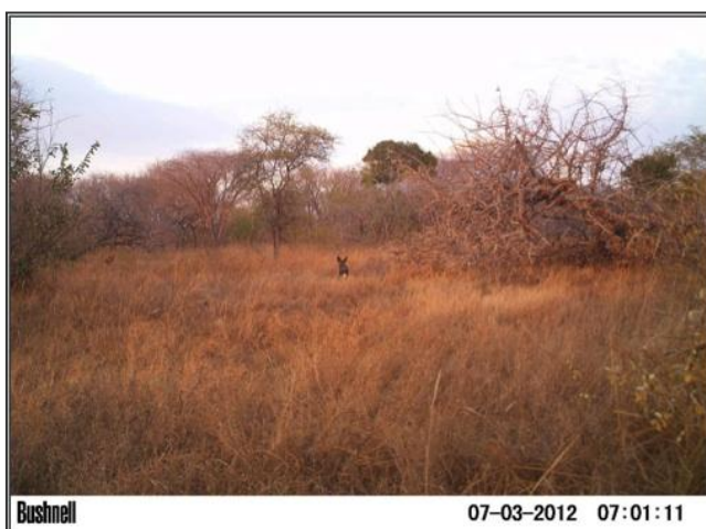
Figure 2. Camera trap image of two wild dogs within the Rukinga Wildlife Sanctuary, south-east Kenya – Sighting S06 on Table 1.