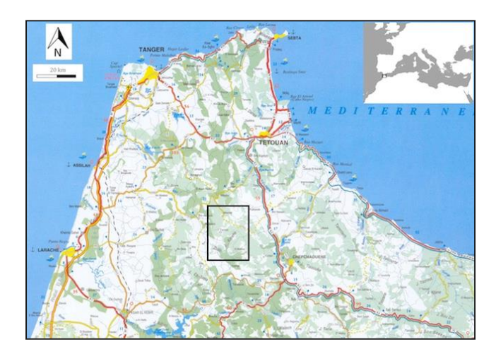
Figure 1. Location of Bouhachem in Morocco