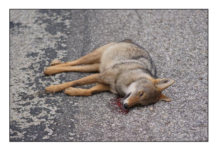
Figure 2. \mathit{Dib} killed by a vehicle in Bouhachem – October 2012

A single haplotype for the two individuals was obtained at cytochrome B but both had different control-region haplotypes, differing by a 1bp mutation. The sequences for each animal were concatenated and aligned against publically available data for Canis species obtained from Genbank (from Aggarwal et al. 2007; Bjornefeldt et al. 2006, Rueness et al. 2011, Gaubert et al. 2012). The resulting alignment was 579bp long. The alignment file is at <a href="http://www.rzss.org.uk/staff/dr-helen-senn">http://www.rzss.org.uk/staff/dr-helen-senn</a> and the sequences have been deposited in Genbank under the accession numbers KM670012-KM670014.