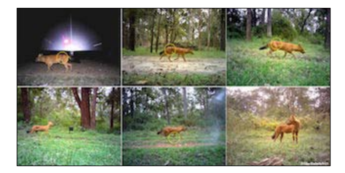
Figure 2: Photo-captures of DHL-101 (top row) and DHL-102 (bottom row); the two individuals from the identified pack.

We identified one individual dhole belonging to a pack, which had distinct scars on the flanks, likely from an injury (Figure 2). This individual was first photo-captured on 8 December 2014 within the limits of Wayanad Wildlife Sanctuary and assigned the ID number DHL-101. Using the encounters of DHL-101, we also identified another another individual with distinct white colouration on the lower right forelimb (Figure 3). The second animal was assigned an ID number of DHL-102. Based on these uniquely identifiable marks, uncommon among dholes, we used photo-encounters of either of these two animals to identify the capture events for the entire pack. The pack consisted of a minimum of five individuals (DHL-101, DHL-102, and three unidentifiable members that were photo-captured in a single image). Since we could not distinctly identify the other members, the pack possibly could have had more individuals. The spatial locations of camera-traps and the number of pack encounters in the corresponding locations are presented in Table 1.