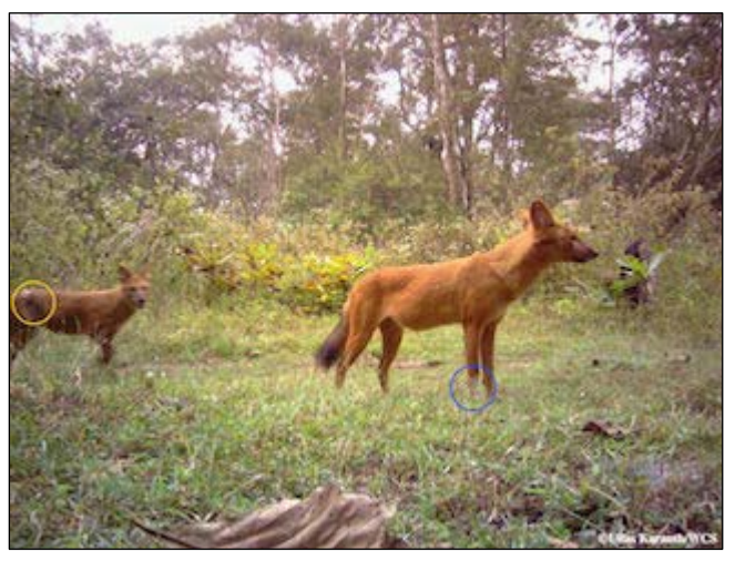
Figure 3: Individuals labelled DHL-101 and DHL-102 from the pack, identified based on an injury mark (yellow circle) and white coloration on the lower right forelimb (blue circle), respectively, photo-captured in a single frame.

Table1: List of camera-trap stations, geographical coordinates and number of encounters of the identified dhole pack in Nagarahole and Wayanad reserves, India. Location code NH refers to Nagarahole National Park, and location code WY refers to Wayanad Wildlife Sanctuary.