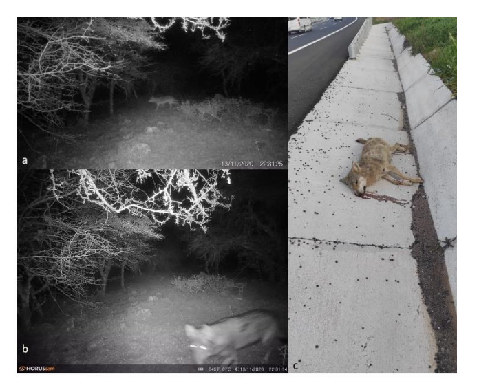
Figure 2. (a, b) First camera trap records of grey wolves and (c) a lactating female grey wolf roadkill in the study area: İzmir, Anatolia, Turkey.

The presence of goat herds without shepherds or LGD in the Yamanlar Mountain KBA indicates that wolves have not been present in this location for a long time, as traditional livestock guarding is not practiced anymore (Ambarlı 2019, Mengüllüoğlu et al. 2019). This recent record of wolves in the Yamanlar Mountain KBA could indicate that wolves are recolonizing the area, but the lack of livestock guarding practices raises concerns about human-wolf conflict. Additional surveys are needed to gather further information on the presence of wolves in the area, reveal numbers, and verify if the individuals are dispersers or part of a breeding pack. Therefore, we invite local municipalities, NGOs, and the Wildlife Department of Ministry of Agriculture and Forestry to cooperatively work on a local action plan to prevent conflict and enable wolf-human co-existence in the study area. The individuals recorded in this preliminary survey and the lactating female wolf road-kill in close vicinity might prove to be very important for the re-establishment of wolves in the western Anatolia.