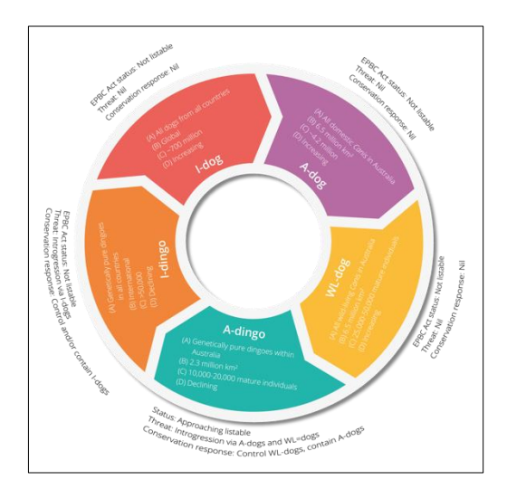
Figure 4. The cycle of confusion underpinning debate about the conservation status of dingoes and the acceptability of key actions to conserve them under current Australian Government legislative instruments (A = general taxonomic description, B = current distribution or extent of occurrence, C = current abundance, D = population trend; see text for further description of the definitions).

Even though cessation or reversal of hybridisation is likely to be impossible across most (or all) of mainland Australia, and Australian dingoes and wild-living dogs are ineligible for listing under the EPBC Act, this reality should not preclude Australian dingo identification and conservation as a threatened genotype. The decision to list or delist an animal should not be contingent on our ability to achieve their recovery (Vucetich et al. 2017). If Australian dingoes are deemed to be threatened, then they should be recognised as threatened, even if we cannot do anything about it. The continued introgression of non-dingo wild-living dog and Australian dog genetics