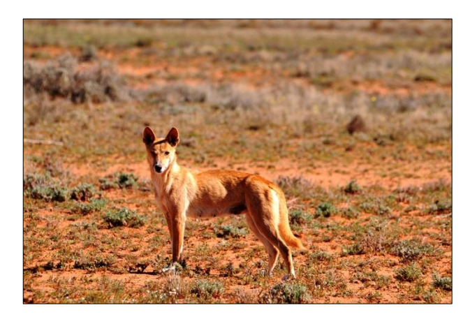
Figure 3. A 'yellow' or 'tan' coloured dingo with five 'white points', often considered by laypeople to represent a pure dingo (or A-dingo), with other colour variants wrongly considered to be WL-dogs or crossbreds.