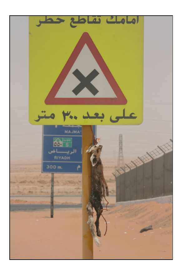
Figure 2. Rüppell's fox hanging from a signpost north of Riyadh in central Saudi Arabia.