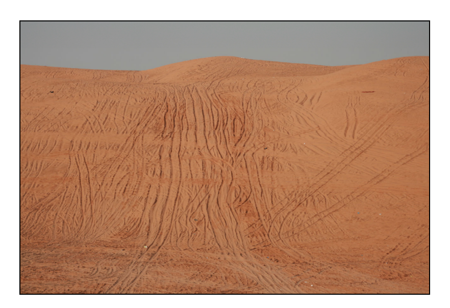
Figure 3. The immediate area where the informal recreation – dune bashing – takes place mainly by local youths.

Settled camel Camelus dromedarius and goat farms, numerous roving stray dogs with no known den sites from the immediate area also