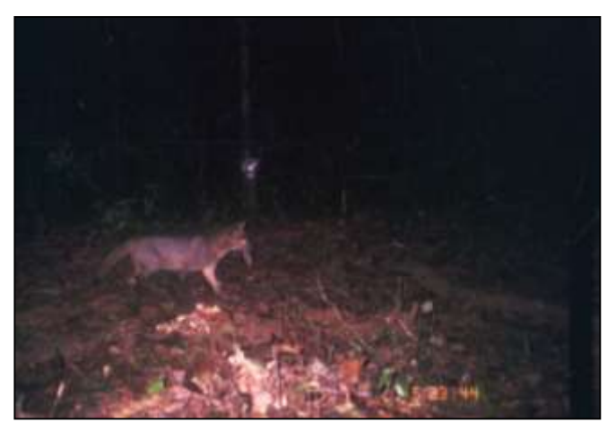
Figure 2: Picture of a crab-eating fox in the Cabo Orange National Park, with an unidentified frog in the mouth (photo with a CamTrakker® camera).

Five pictures of crab-eating foxes were obtained on two different cameras spaced 2km apart at the following coordinates: 3.18^\circ N \ / \ 51.27^\circ W and 3.19^\circ N \ / \ 51.26^\circ W (Figure 2). These sites were located 200m from the Cassiporé River on small trails used by hunters in a riparian forest joining two savanna patches. All pictures were taken at night or before dawn (1930h, 2103h, 2300h, 0221h, 0540h). In four of the pictures only one animal was featured, yet the fifth picture showed two crabeating foxes, presumably a female and her young. According to local people living close to this part of the Cabo Orange National Park, the species is not rare in the area.