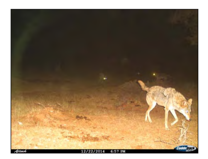
Figure 2. Wolves and hyaenas at the kill site in Kailadevi Wildlife Sanctuary, Rajasthan, India.

Due to high anthropogenic activity in the area, camera traps (Cuddeback, Green Bay, Wisconsin, USA) were deployed at the kill site immediately to determine the species involved in the depredation. At approximately 1830hrs, the team initially saw an Indian fox near the kill, which quickly disappeared as soon as a pack of three to four wolves arrived. Within five to six minutes there was a flash from a camera trap, followed by some barking-like sounds indicating hyaena presence. The wolves moved away initially, but came back again within minutes and quarrelled over the carcass with hyaenas numbering around two to three for around five to ten minutes. There were clear chomping sounds of bone probably made by the hyaenas, who also dragged the carcass a few metres away from the camera traps. The wolves took over the carcass and chased away the hyaenas (Figure 2). There was clear interaction between the wolves and the hyaenas, although no injuries on either species were recorded. The carcass was completely consumed.